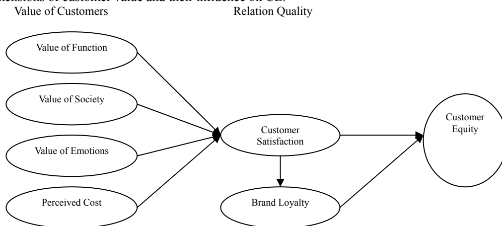
Figure 2 Model of Value-CRM Based on CE

According to research results by Wang Yonggui and others (2001, 2005) [4] , in the process of CRM, the creation and delivery of CE is placed in a vital situation. It is a strategic weapon for construction, containment, update and full application for close relations with customers, and it is also an advantageous foundation for launching strong and sustainable competition. Customer value is a concept corresponding to CE which is put forward by Rust; as an effective evaluation of customer relations, quality relation includes relation equity and something about brand equity, which has a pivotal effect on the improvement of CE. In Graph 2, it is described that based on the framework of CRM, the key dimensions of customer value and their influence on CE.